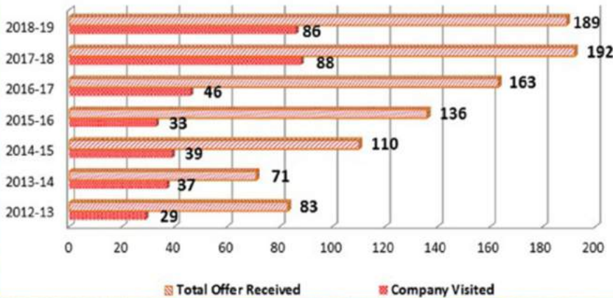
No. of Companies visited and Total offer received

This year, one international offer was received from FujiFilm Software Company Ltd., a Japanese Firm.