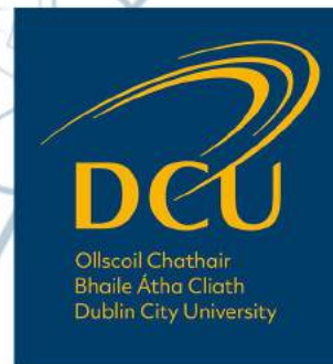
Dublin City University