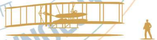
WRIGHT STATE UNIVERSITY