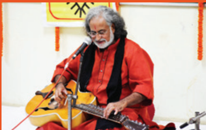
Pt. Vishwa Mohan Bhatt