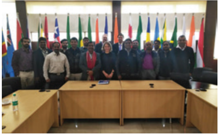
World Solar Cooperation and Validation team of National Institute of Solar Energy