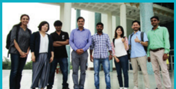
A few glimpses of campus drive at IIT Patna