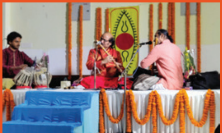
Pt. Ronu Majumdar

The fourth Spic Macay evening was organised in the month of January 2019, with the flute performance of Pandit Ronja Majumdar on 11th January along with other artists.